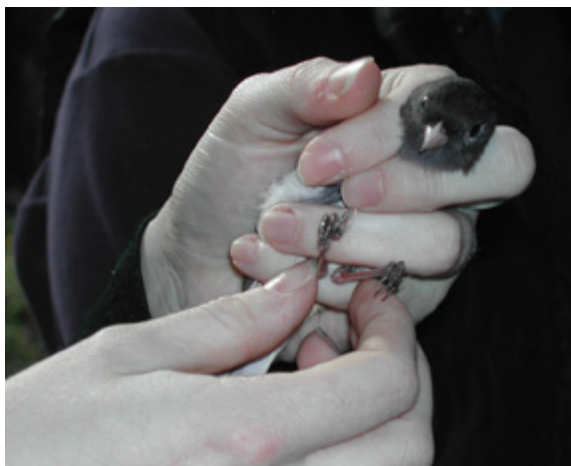
Oregon Juncos are a favourite for training.

RPBO has been offering introductory avian monitoring and banding workshops since 2003, and has now had close to 100 participants take the course. On March 19 to 21, another group of eager bird enthusiasts will be learning the ropes at Royal Roads University. Please share information about the workshop with others you think may be interested in attending.